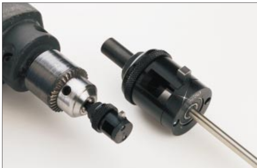
Thermocouple Wire Stripper for OMEGACLAD® wire. See PST Series Strippers in Section H.